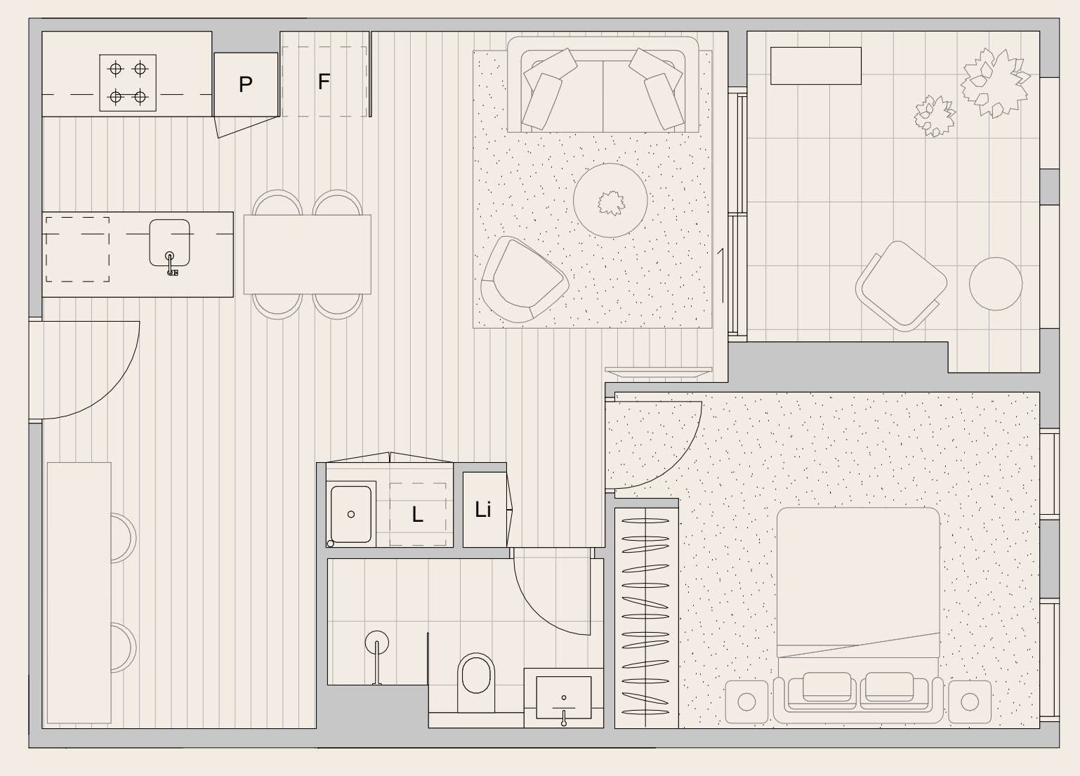
View Virtual Tour

Disclaimer: These plans are for presentation purposes and are to be used as a guide only. These plans were completed prior to the completion of final design, engineering and construction of the building, therefore design, engineering, dimensions, areas, fittings, finishes, window placement, column size and placement and specifications are subject to change without notice in accordance with the provisions of the Contract of Sale. Unless expressly included in the specifications in the Contract of Sale, all furniture and whitegoods are not included. All calculations are based on Property Council of Australia Residential Method of Measurement guidelines and are an estimate only. Any dimensions or areas may differ from surveyed areas due to different methods of measurement. Location of condenser units may change. Purchasers should check the building plans and specifications included in the Contract of Sale carefully before signing the Contract of Sale.